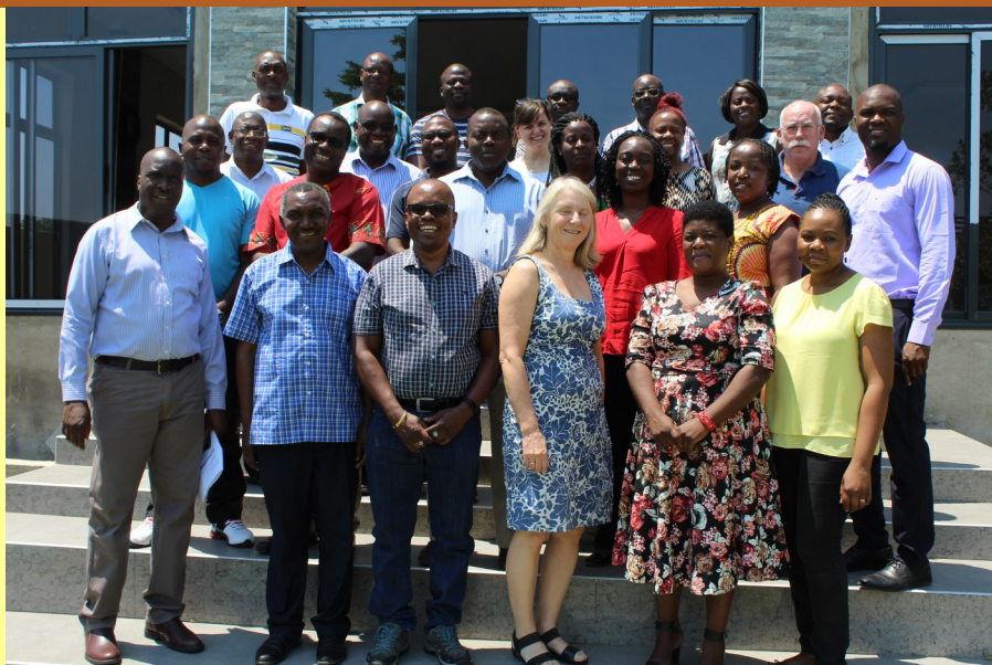
Group Photo of postgraduate students' supervisors during the Research Supervision training workshop organised by ACEIDHA and FORTECASE in Kabwe from 28 th to 30 th October 2019 .