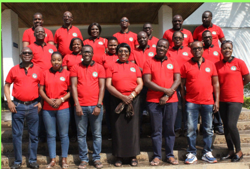
ACEIDHA team taking a group photo on last Day of the workshop