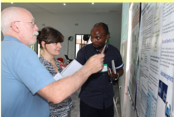
Student explaining his research poster