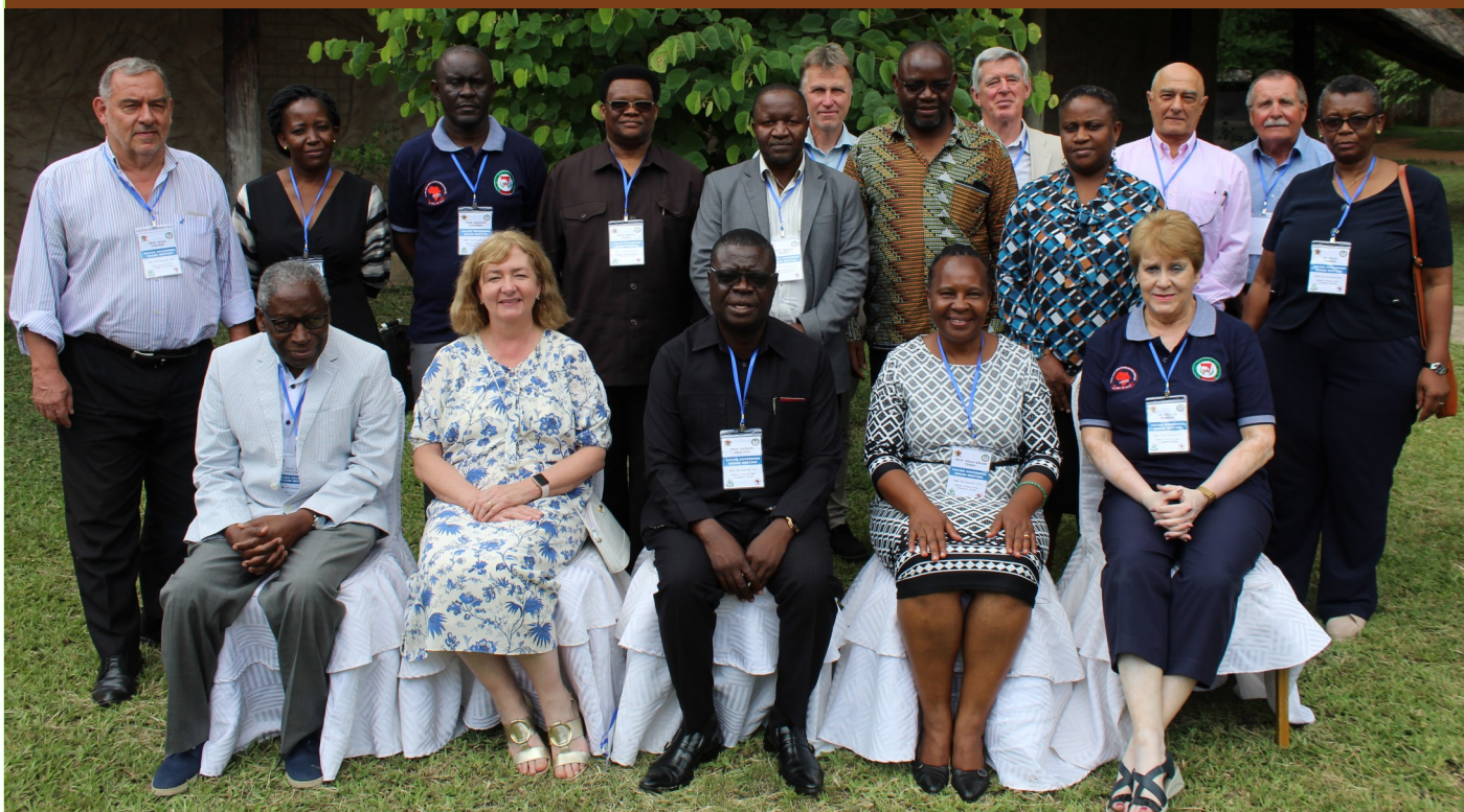
International Scientific Advisory Board members pose for a group photo on 16 th December 2019 in Livingstone, Zambia.