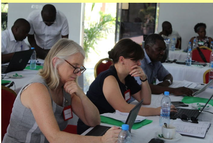
Trainers preparing presentations