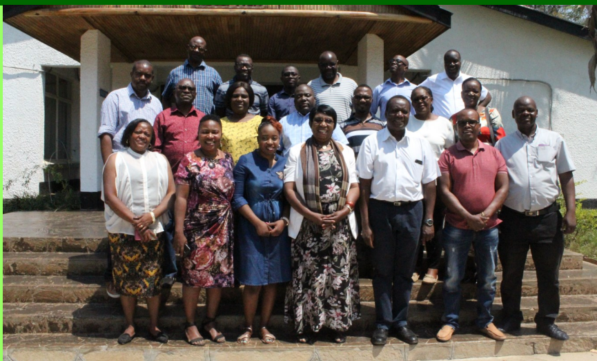
ACEIDHA team taking a group photo on the 2 nd Day of the workshop

The workshop runs from 7th to 11th October 2019 at Manchinchi Bay Lodge in Siavonga.