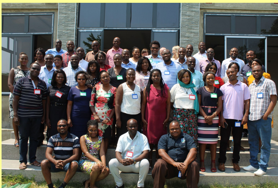
ACEIDHA sponsored PhD students at the ACEIDHA and FORTECASE organised training workshop in Kabwe pose for a group Photo.